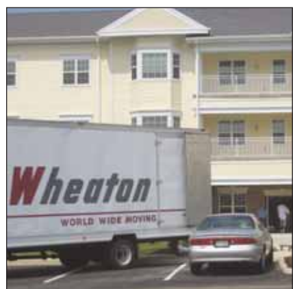
One of the many moving vans arrives.

With the three-year construction project finished, only minor details needed attention as June came to a