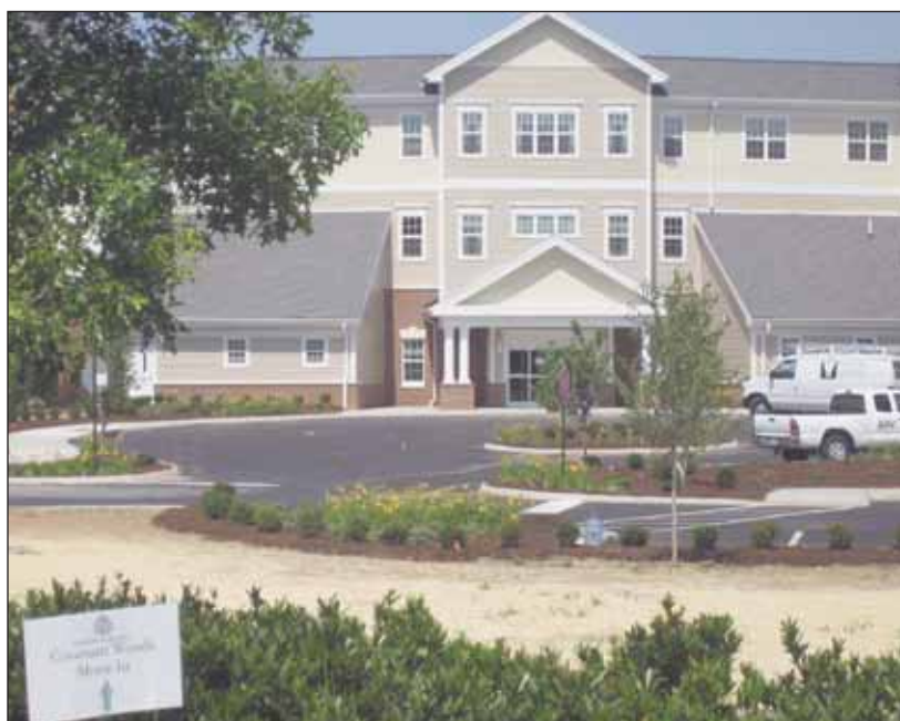
New wing awaits the new residents and signs point the way.

Though the opening of the new wing is itself a cause for celebration, a truly special event is planned for early fall. Be sure to mark your calendar for the official Grand Opening on Friday, September 14. Refreshments and festivities are in store to mark the successful completion of this major milestone in Covenant Woods history.